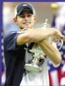
Andy Roddick 2003 U.S. Open Champion